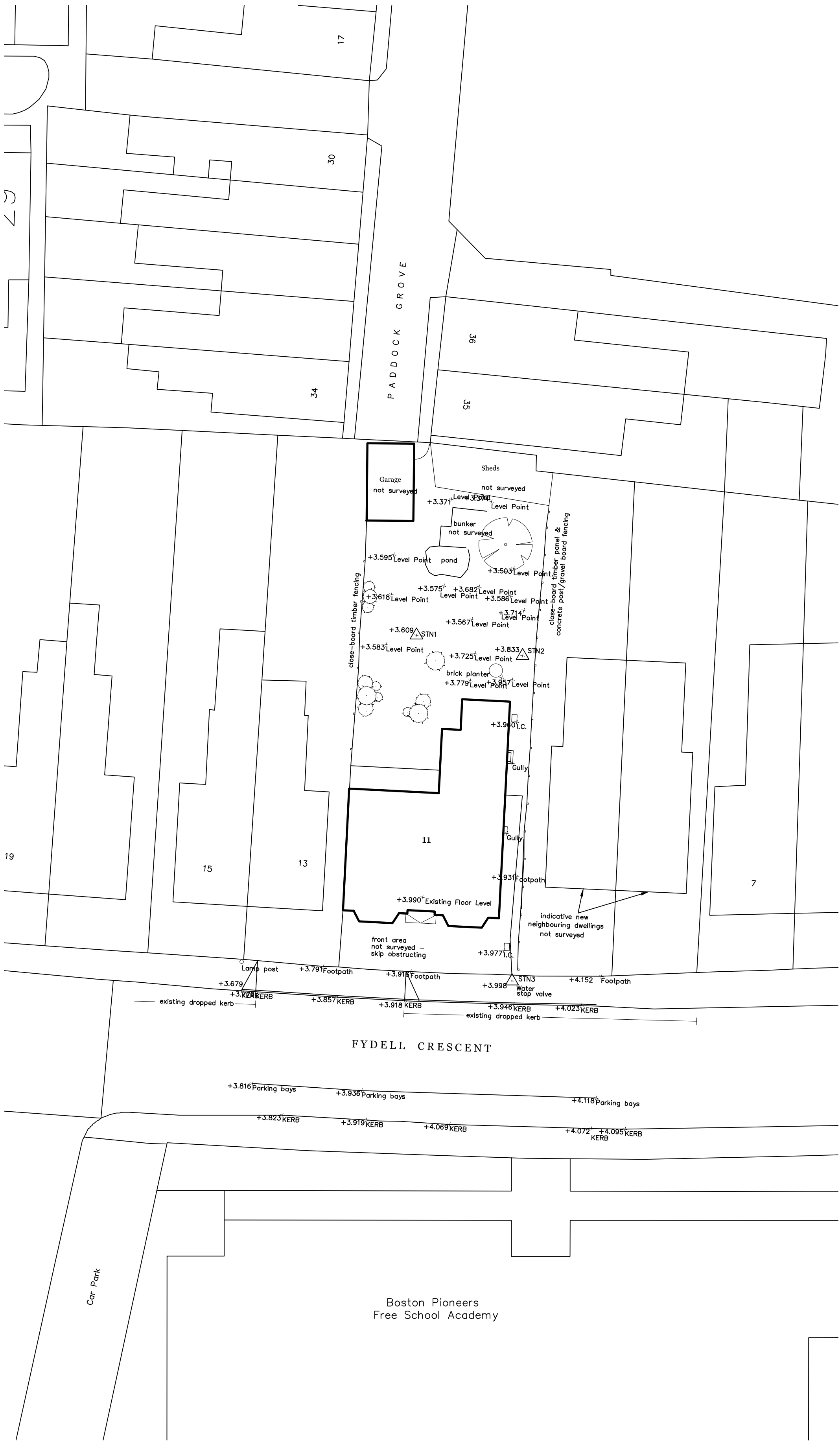
SITE PLAN AS EXISTING SCALE 1:200 1:200 0 1 2 3 4 5 10 m